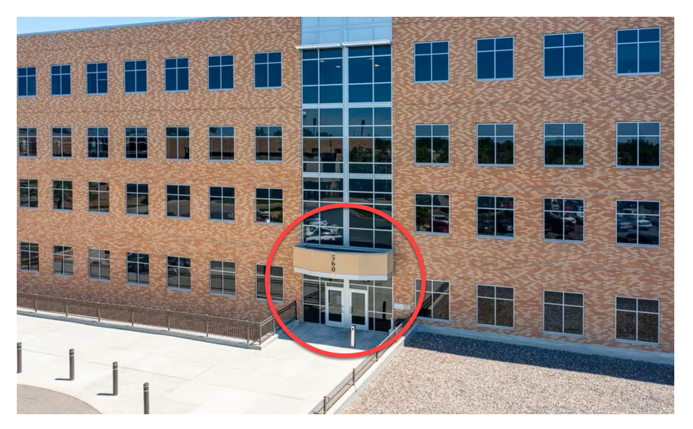
Our clinic is located inside the 560 Ridgeview Professional Building.